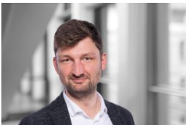
FDP City councillor