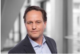
AfD City councillor