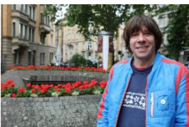
Parliamentary group PULS City councillor